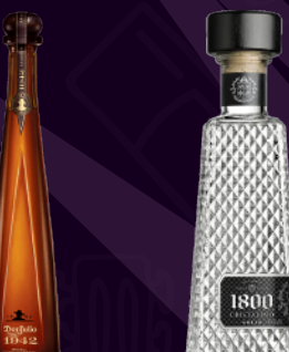
DON JULIO EL CHARRO ESPOLÓN EXOTICO HORNITOS EL JIMADOR JOSE CUERVO MILAGRO